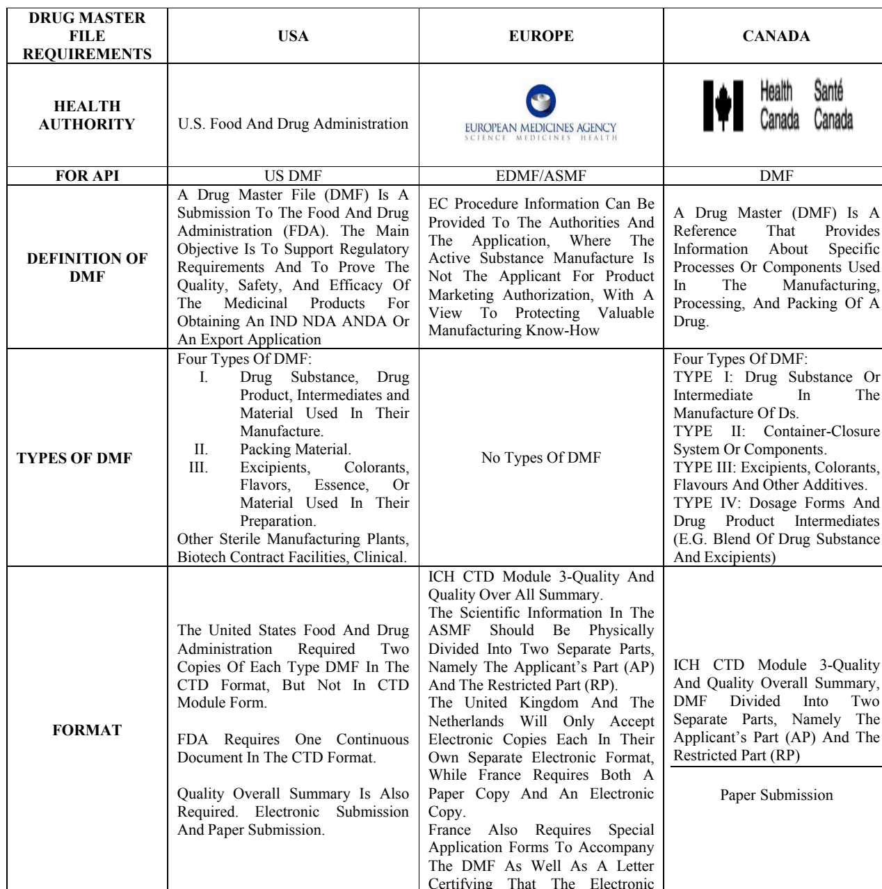
Table 3: Comparison of DMF's of USA, Europe and Canada: