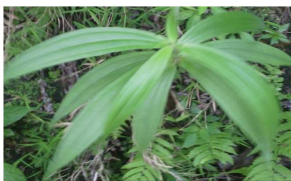
Fig .no.2: Pouzolzia weightii leaves