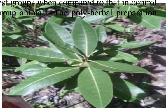
Fig no.1: Buchanania angustifolia leaves

reduced the ulcer index and protected the animals from affecting to ulcers. The poly-herbal preparation also increased the mucous secretion in pylorus ligation method in test animals. The aqueous extract of the poly-herbal preparation of Buchanania angustifolia , Pouzolzia weightii , has shown the effective antiulcer activity when compared to that in control.