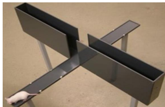
Fig. 2. The plus maze apparatus

before being placed individually in the center of the apparatus, facing the closed arm. The time spent and the numbers of entries in both the open and the closed arms were recorded for 5 min. An entry was defined as having all four paws within the arm (RS Adnaik, 2009).