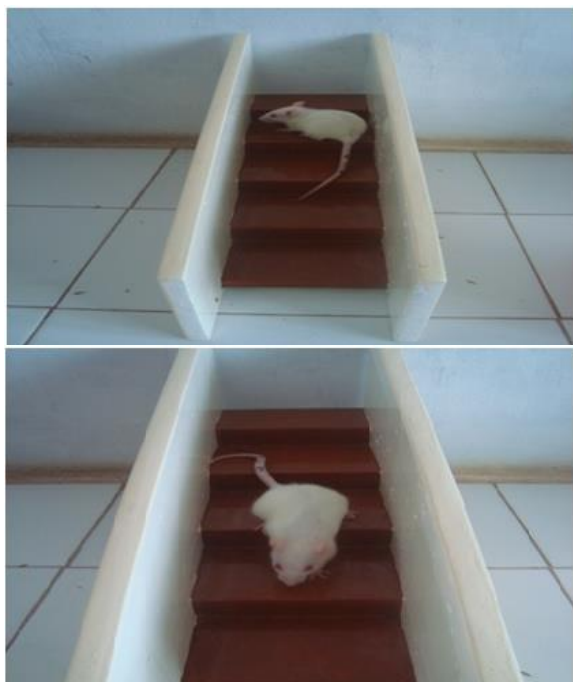
Fig 3. stair case test