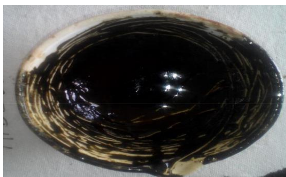
Capsicum flowers extract