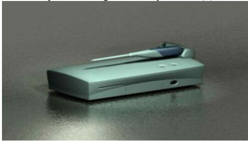
Figure 1 (a)