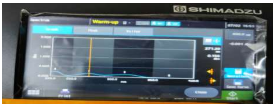
Figure 1. Spectra of Donepezil hydrochloride for wavelength estimation